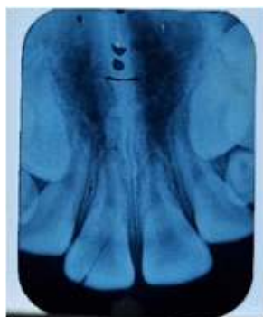
Figure 2- Pre operative radiograph showing opex apex in the fractured tooth