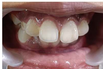
Figure 3- After reattachment of the fractured tooth segment

and the bleeding was arrested with help of sterile moist cotton pellet. White MTA was freshly mixed and placed over the exposed pulp, following which a saline-soaked cotton pellet was placed over the MTA for 45 minutes to allow it to set. The exposed dentin and MTA were both sealed with temporary restorative material (3M™ Cavit™).