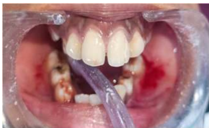
Figure 1- Preoperative photograph showing Ellis Class III fracture in permanent upper left maxillary incisor