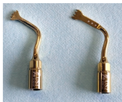
Figure 4. Tip with elongated blade length

insert. However it is still used for finishing tool on freshly cut bone edges. In view of increasing cutting efficiency of OT2 insert under gone through several modification over a period of time and resulting in OT6 and OT7. OT 6 with saw like edges and OT7 with same design characteristics with elongated blade (Fig 4) which provides better depth 21 . Apart from various cutting tips (Fig.5) there are various non cutting blunt edged tips are also available depending on their specific applications on various tissue sites and mode of operation (Fig 6). These tips can be diamond coated or titanium nitrate coated depending on their specific use .Unlike rotary instruments and surgical saw piezo tips use high frequency vibration to cut the bone. Pressure prevents vibration, generates heat and reduces efficiency. The optimum force varies from 1.5 -3 N 22,23 . Beyond 3N pressure cutting efficiency does not improved but thermal damage increased 24 .