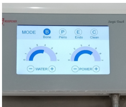
Figure 2. Control panel