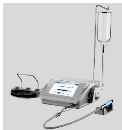
Figure 1. Piezo surgical unit

It is the control unit of whole system (Fig.1) consist of different programme setting based on the application in different field of dentistry. Bone, Perio and Endo are the different programme modes and scheduled for different power output during operation. Nowadays there are various models available in the market by different manufacturers who provides some added function of the device for better functioning (Fig.2). Apart from programme button it has one power control knob and one water control knob specified for controlling power output and water flow respectively.