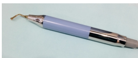
Figure 3. Hand piece with surgical insert